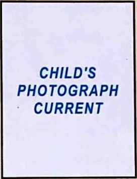
CHILD'S PHOTOGRAPH CURRENT